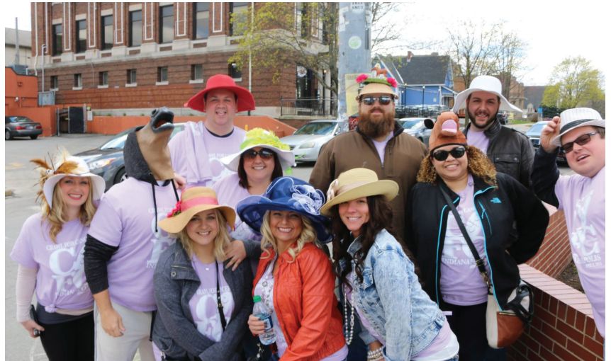
Crawl for Cancer