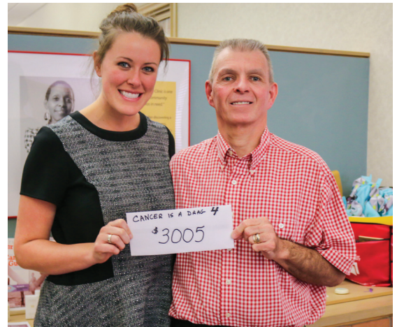
Cancer is a Drag