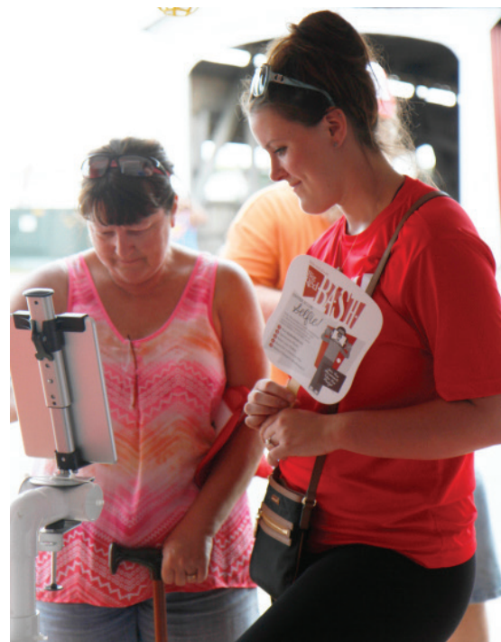
A woman pledges to #BashCancer at the State Fair Big Red Bash tent.

*Donors listed gave between Nov. 1, 2015 and Apr. 31, 2016