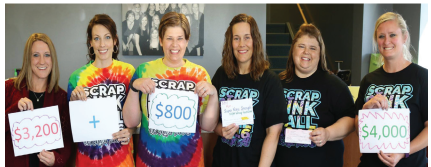
Scrap Pink Ball + Super Nana Strength

*Donors listed gave between Nov. 1, 2015 and Apr. 31, 2016